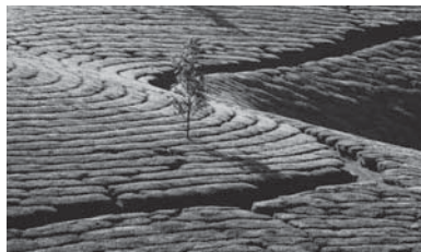
Figure 5 - PLANTATIONS MUNNAR

Incentives offered by state governments include subsidized land cost, relaxation in stamp duty, and exemption on sale/lease of land, power tariff incentives, concessional rate of interest on loans, investment subsidies/tax incentives, backward areas subsidies and special incentive packages for mega projects. Incentives are provided for setting up projects in special areas – the North-east, Jammu & Kashmir, Himachal Pradesh and Uttarakhand. Incentives from the Ministry of Tourism include assistance in large revenue-generating projects. Support to PPPs in infrastructure development such as