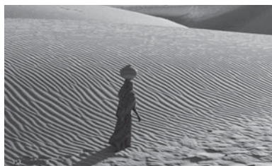
Figure 1 - JAISALMER DESERT RAJASTHAN

As a part of evolution and recognition by various governments in greater measure, several offshoots of tourism are emerging. These are classified under "Niche Tourism" and comprise agro tourism, heritage tourism, wellness/medical tourism, wildlife tourism, cultural tourism amongst others. I have deliberately excluded two large segments which are arguably country specific which I will treat separately. These are "leisure tourism & spiritual tourism" not only because they have a large market but have high growth potential and better included in the mainstream tourism in India.