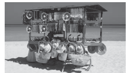
Figure 2 – ADDING VALUE TO THE LOCAL COMMUNITY

The fastest growing world region in 2016, 2017, and 2016-20 will be South Asia, led by strong growth in India , whose economy is expected to outperform China.