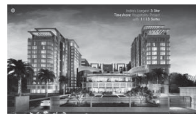
Figure - 4 TIMESHARE PROJECT AMRITSAR

Vacation ownership in India is clearly a front runner in the tourism (hospitality) industry. The vacation ownership in India has been growing at a CAGR of over 15% during the last five years. There is a visible increase in the number of timeshare owners; because holidayers are seeking new leisure options – an indication of rapidly changing lifestyles where holidaying has become a necessity. The timeshare industry in India is fairly new and is in its developmental and growth stage. Studies have revealed there are 80 timeshare companies having more than 180 resorts. Over 500000 families take to leisure travel every year in timeshare resorts in attractive destinations throughout the country. The scales are small but have a tremendous potential to grow in view of the fast changing demographic patterns in India. Timeshare is a great driver of domestic tourism and is less vulnerable to external disturbances – political, economic or geo-physical.